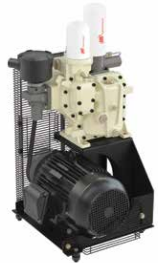
Vertically-stacked drive components reduce overall footprint by 20%.