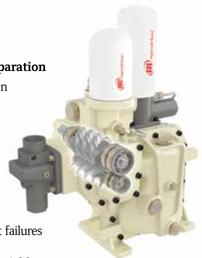
The all-in-one CE55X airend features improved air/oil separation and reliability.