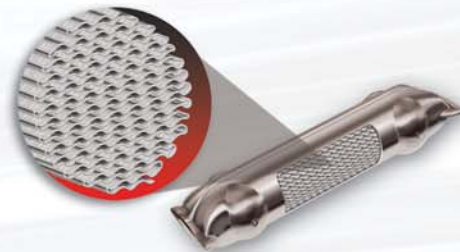
The heat exchanger features a unique corrugated stainless steel panel to help ensure reliability.