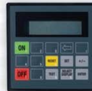
The DPC features a user-friendly push-button interface putting you in complete control.